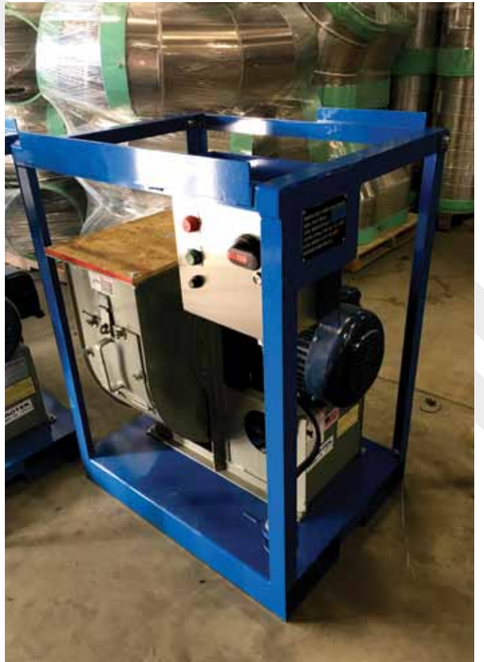
Easy access portable equipment.