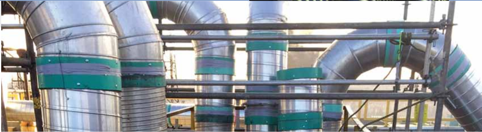
Quick fit ducting for rapid setup and tear down.

Aerotek offers a broad line of HVAC equipment to provide the performance and comfort for every project.